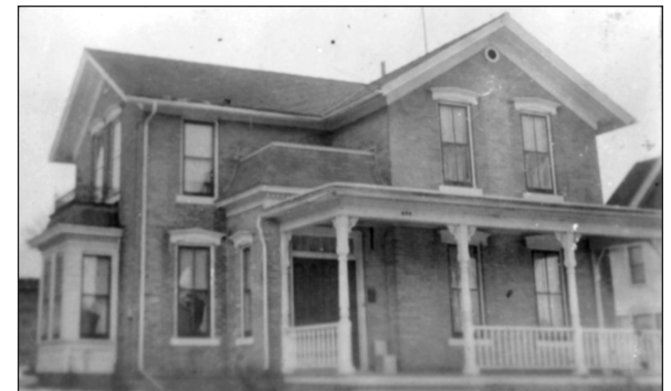
MURDER SUICIDE, 400 NORTH CHURCH STREET ▽

A Guide to the Historic Neighborhoods of Watertown produced by the: